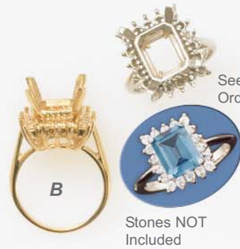
See Below for Order Number