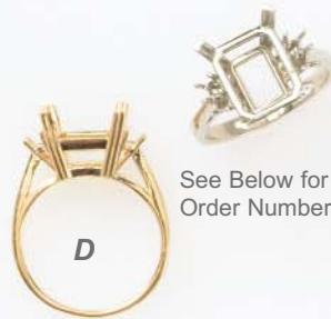
See Below for Order Number