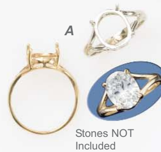
Stones NOT Included