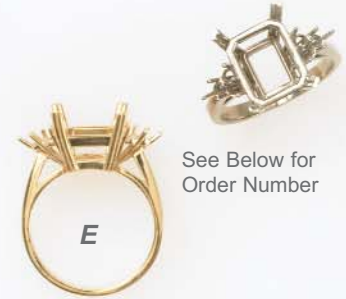
See Below for Order Number

Southeastern Findings, Mountings, Tools and Wedding Bands