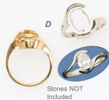
Stones NOT Included