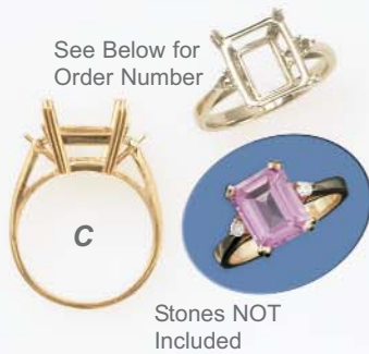
See Below for Order Number