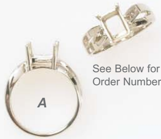
See Below for Order Number