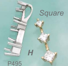
P495 Stones NOT Included