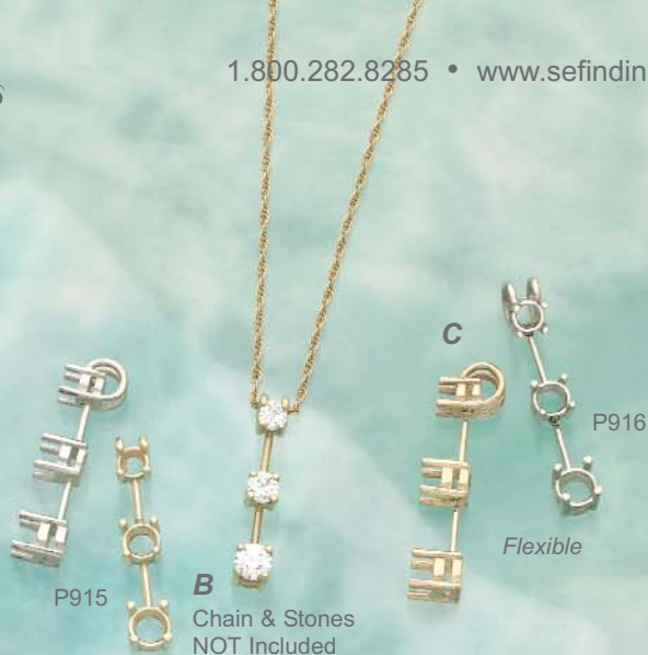
B Chain & Stones NOT Included