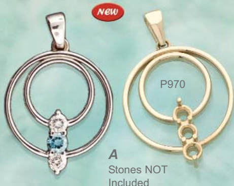
A Stones NOT Included