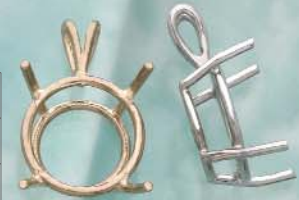
P466, 4 Prong with Tube Bail ... Cast