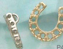
P4-36 P4-37 P4-38