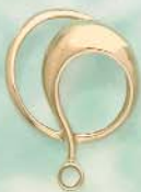
P5-41, "X" Design