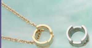
P63, Bezel, Chain NOT Included ... Cast