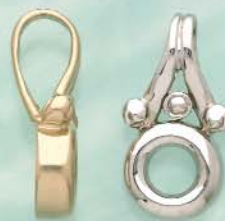
P816 ... Cast