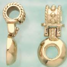
Solitaire Pendants ... Cast