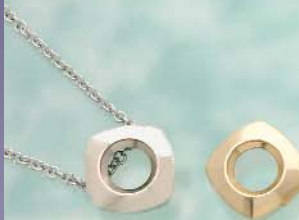
P64, Bezel, Chain NOT Included ... Cast