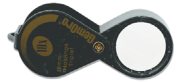
18mm Hex Black Marble 10x Hastings Triplet T-865