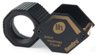
21mm Hex Black 10x Hastings Triplet with rubber grip. T-616