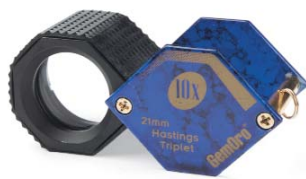
21mm Hex Blue Marble 10x Hastings Triplet with rubber grip. T-617