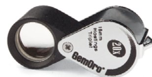
18mm Oval Chrome 20x Hastings Triplet T-655