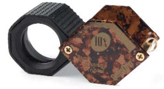
21mm Hex Brown Marble 10x Hastings Triplet with rubber grip. T-615