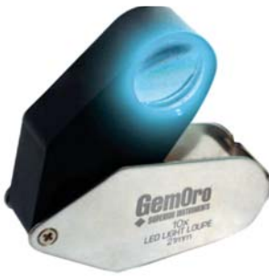
21mm, 10x lighted Loupe