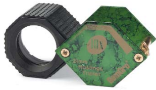
21mm Hex Green Marble 10x Hastings Triplet with rubber grip. T-613

High quality 18mm & 21mm loupes with excellent magnification, superior Japanese optics, three bonded aplanatic and achromatic color corrected lenses.