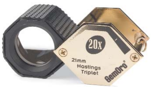
21mm Hex Gold 20x Hastings Triplet with rubber grip. T-660