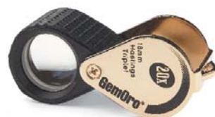
18mm Oval Gold 20x Hastings Triplet with rubber grip. T-657