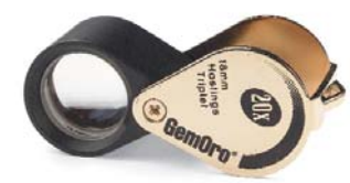
18mm Oval Gold 20x Hastings Triplet T-656