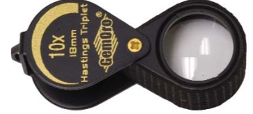
18mm Black 10x Hastings Triplet with rubber grip. T-874