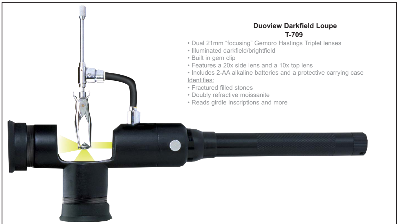
Duoview Darkfield Loupe