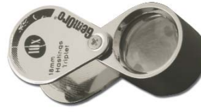
18mm Chrome 10x Hastings Triplet T-862