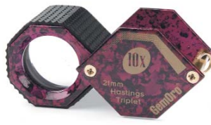
21mm Hex Pink Marble 10x Hastings Triplet with rubber grip. T-614