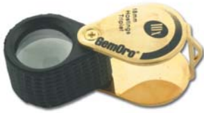
18mm Gold 10x Hastings Triplet with rubber grip. T-864