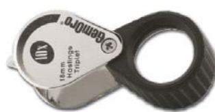
18mm Chrome 10x Hastings Triplet with rubber grip. T-863