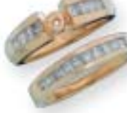
.42ct 14K Y/W UC 42/2389/23 G-H SI $1311