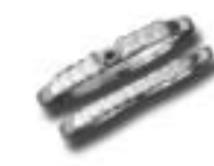
.12ct 14K Y/W RC 12/7598/24 G-H I1 $405