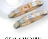
.25ct 14K Y/W UC 25/7404/23 G-H SI $1077 GOLD $1707 PLATINUM