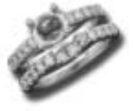
.30ct 14K Y/W RC 30/7217/24 1ct Round Center G-H I1 $840