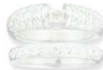
Semi Mount 14k Y/W

.75ct 14K Y/W RC 75/7654/24 G-H I1 $1704