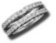
.36ct 14K Y/W RC 36/7596/24 G-H I1 $876