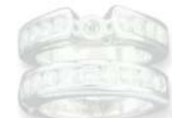
Semi Mount 14k Y/W

.80ct 14K Y/W RC 80/7643/24 G-H I1 $2010