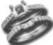
.24ct 14K Y/W RC 24/7219/24 5mm Square Center G-H I1 $744