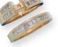
.53ct 14K Y/W UC 53/2391/23 G-H SI $1440