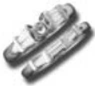
.40ct 14K Y/W/TT UC 40/7214/23 G-H SI $1824