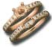
.20ct 14K Y/W RC 20/7215/24 1/2ct Round Center G-H I1 $615