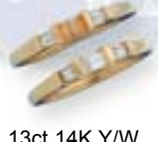
.13ct 14K Y/W UC 13/7403/23 G-H SI $579