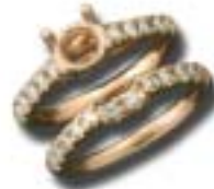
.30ct 14K Y/W RC 30/7216/24 3/4ct Round Center G-H I1 $825