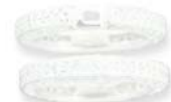
Semi Mount 14k Y/W