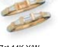
.37ct 14K Y/W UC 37/7405/23 G-H SI $1665 GOLD $2217 PLATINUM