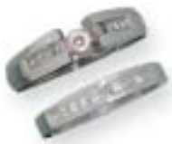
.25ct 14K Y/W UC 25/2388/23 G-H SI $675