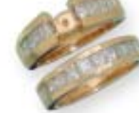
1.00ct 14K Y/W UC 100/2390/23 G-H SI $3465