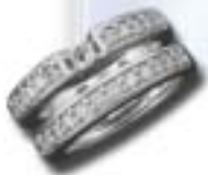
.30ct 14K Y/W RC 30/7213/24 G-H I1 $885