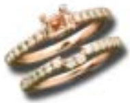
.24ct 14K Y/W RC 24/7218/24 4mm Square Center G-H I1 $690