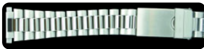
16-22mm Straight Adjustable End Metal Band TM-1536S Stainless $6.36 ea.