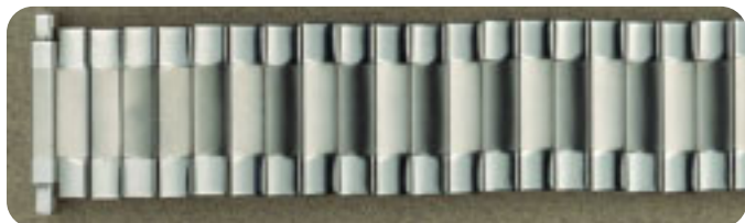
17-22mm Straight Adjustable End Metal Expansion Band TM-532S Stainless $4.11 ea.