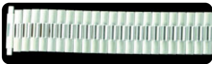
17-22mm Straight Adjustable End Metal Expansion Band TM-534S Stainless $4.49 ea.