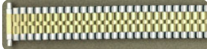
17-22mm Straight Adjustable End Metal Expansion Band TM-536T Two Tone $4.49 ea.