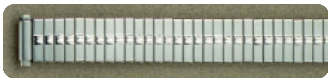
11-15mm Straight Adjustable End Metal Expansion Band TM-132S Stainless $4.86 ea.