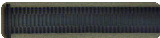
17-22mm Straight Adjustable End Metal Expansion Band TM-552B Black $4.49 ea.