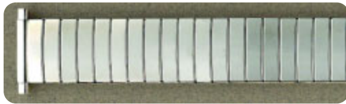
16-20mm Straight Adjustable End Metal Expansion Band TM-500S Stainless $3.36 ea.