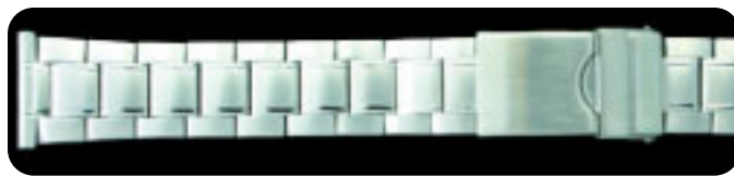
20mm Straight End Metal Band TM-1510S Stainless $7.49 ea.

**Pricing shown is actual pricing. No minimum order restrictions.**