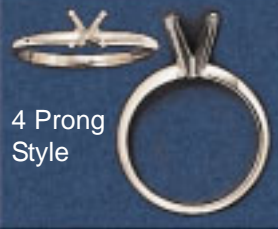
4 Prong Style