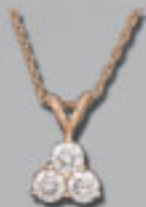
Series RV 7912/24 14K Y/W G-H I1 Chain Included .50ct $1221 .74ct $1836 .93ct $2568