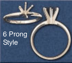
6 Prong Style