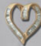
UV50/2382/24 14KY G-H I1 .50ct TW $579

*The #'s after the first 2 letters in each part number represent exact carat weight. Example: UC 25/2388/23 is .25ct TW.*