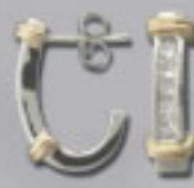
RF75/2376/24 14K TT G-H I1 .75ct TW $1605