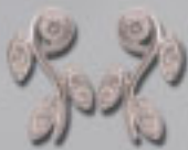
RF31 W Spec/2+4 14KW G-H SI3 .31ct TW $675