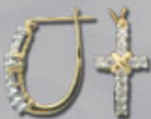
RF50/1680/PQ 10K TT Promotional Quality .50ct TW $363