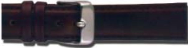
T-9203 20mm Brown Oilskin $12.84