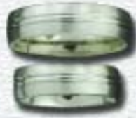
Striped with Dome Center 6mm 5-8 8.5-11.5 WB-06-02 $536 $632