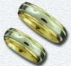
Two Tone Textured Domed 6mm 5-8 8.5-11.5 WB-06-17 $703 $829