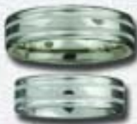
Brite with Textured Stripes 6mm 5-8 8.5-11.5 WB-06-08 $525 $632