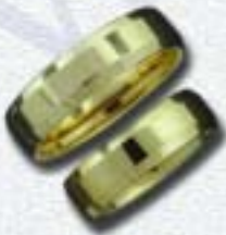
Beveled Edge 6mm 5-8 8.5-11.5 WB-06-07 $620 $739