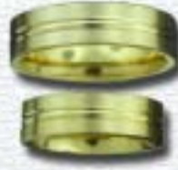
Flat with Center Stripe 6mm 5-8 8.5-11.5 WB-06-11 $620 $739