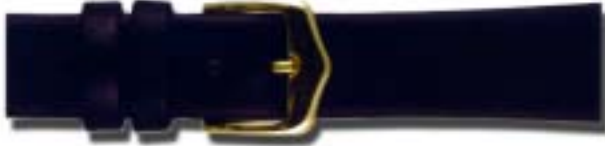
T-9202 20mm Black Calfskin $9.00