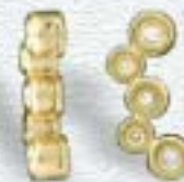
Series P384 025 2) .07, .03 & 1) .05ct $119 050 2) .15, .05 & 1) .10ct $128 075 2) .20, .10 & 1) .15ct $191