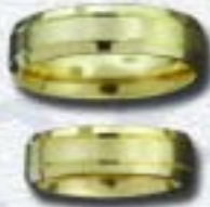
Beveled Brite Edge with Satin 6mm 5-8 8.5-11.5 WB-06-05 $620 $739