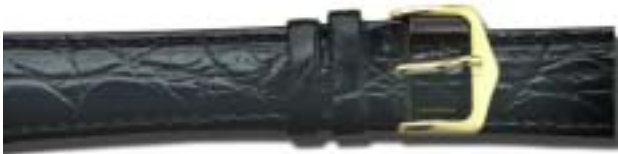
T-9204 20mm Black Crocodile Grain $12.84