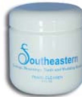
Pearl Cleaner T-889 $4.74 ea.