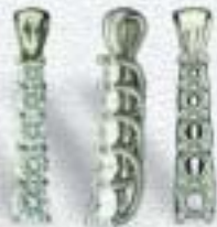
Series P710 025 1) .02, .04, .05, .06, .08ct $104 050 1) .05, .08, .10, .12, .15ct $128 075 1) .07, .12, .15, .18, .23ct $151 1ct 1) .10, .15, .20, .25, .30ct $176