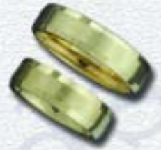
Beveled with Satin Stripe 6mm 5-8 8.5-11.5 WB-06-03 $620 $739