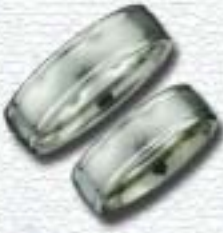
Stone with Brite Edge 6mm 5-8 8.5-11.5 WB-06-10 $525 $632