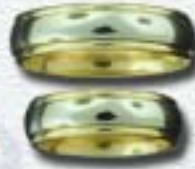
Two Tone Domed 6mm 5-8 8.5-11.5 WB-06-16 $703 $829