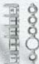
Series P709 025 1) .15, 4) .025ct $84 033 1) .20, 4) .025ct $93 050 1) .25, 4) .06ct $111 075 1) .35, 4) .08ct $130 1ct 1) .50, 4) .12ct $139 1.50 1) .75, 4) .185ct $177 2ct 1) 1ct, 4) .25ct $186