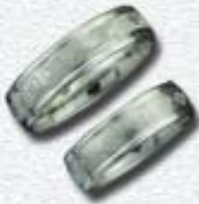
Greek with Brite Edge 6mm 5-8 8.5-11.5 WB-06-15 $525 $632