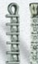
Series P712 025 1) .01, .03, .05, .07, .09ct $91 050 1) .05, .08, .10, .12, .15ct $128 075 1) .05, .10, .15, .20, .25ct $159 1ct 1) .10, .15, .20, .25, .30ct $178 1.50 1) .20, .25, .30, .35, .40ct $198 2ct 1) .20, .30, .40, .50, .60ct $235