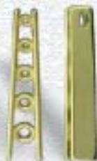
Series P705 1) .05, .10, .15, .20, .25ct P705 075L Light $215 P705 075H Heavy $266

SEE NAMANO PGS 6-7 FOR FINISHED PENDANTS