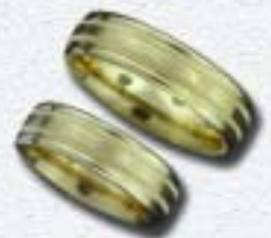
Satin Center with Textured Stripes 6mm 5-8 8.5-11.5 WB-06-09 $525 $632