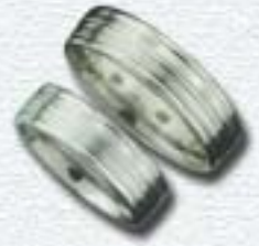
Satin with 3 Stripes 6mm 5-8 8.5-11.5 WB-06-12 $578 $742