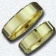
Satin with 8 Brite Bars 6mm 5-8 8.5-11.5 WB-06-18 $682 $813