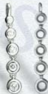
Series P714 025 1) .01, .03, .05, .07, .09ct $227 050 1) .06, .08, .10, .12, .14ct $258 075 1) .05, .10, .15, .20, .25ct $262 1ct 1) .10, .15, .20, .25, .30ct $303 1.50 1) .20, .25, .30, .35, .40ct $347 2ct 1) .20, .30, .40, .50, .60ct $374