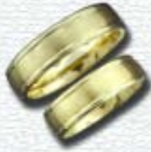
Satin with Brite 6mm 5-8 8.5-11.5 WB-06-01 $525 $632