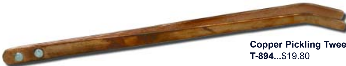
Copper Pickling Tweezers T-894...$19.80